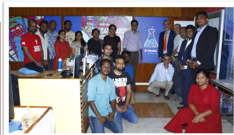
Research group with Trimble executives